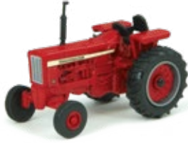
1:64 International Vintage Tractor 46573 Pack: 12 - Age grade 3+