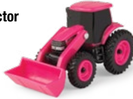
1:64 Case IH Pink Tractor with Loader 46705 Pack 8 - Age grade: 3+