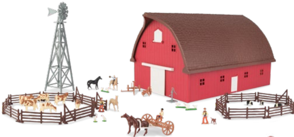
1:64 Farm Country Gable Barn 46765 Pack: 2 - Age grade: 3+