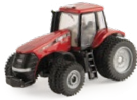
1:64 Case IH Modern Tractor 46502 Pack: 4 - Age grade: 3+