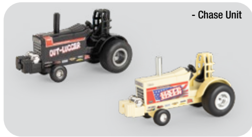
- Chase Unit