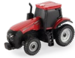
1:64 Case IH AFS Connect™ Magnum™ 380 Tractor 47166 MIN Pack: 4 - Age grade: 3+