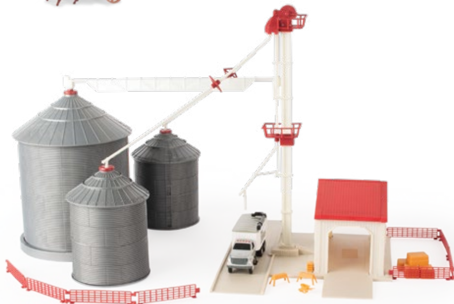
1:64 Grain Elevator Set 12924V Pack: 4 - Age grade: 5+