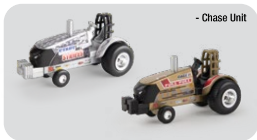
- Chase Unit

"Sixty-Sixer" puller tractor with chase unit.